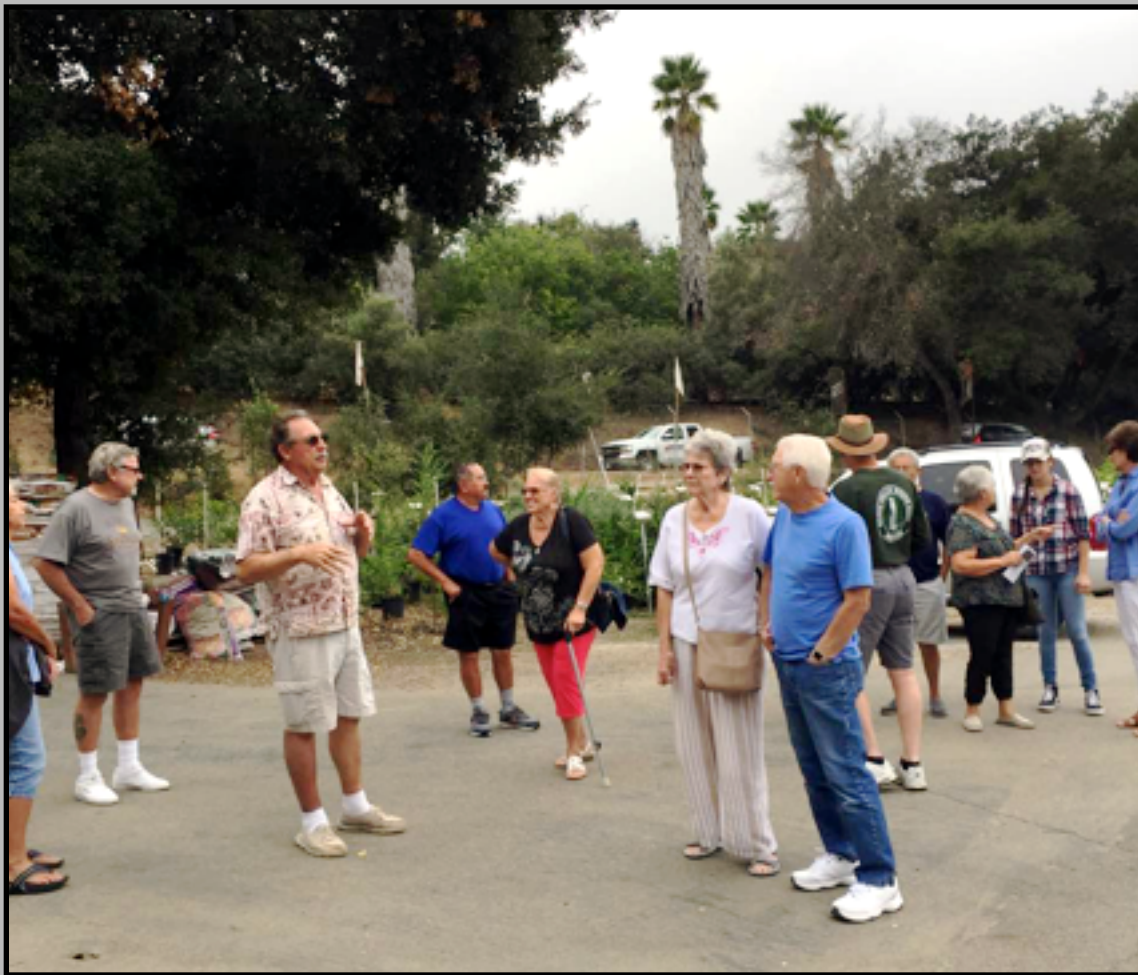
Visiting Myrtle Creek Botanical Gardens