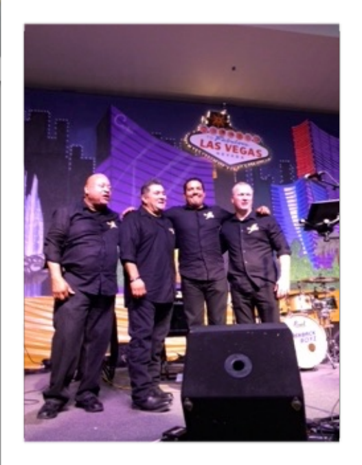
The Flashback Boys We knew the lyrics.