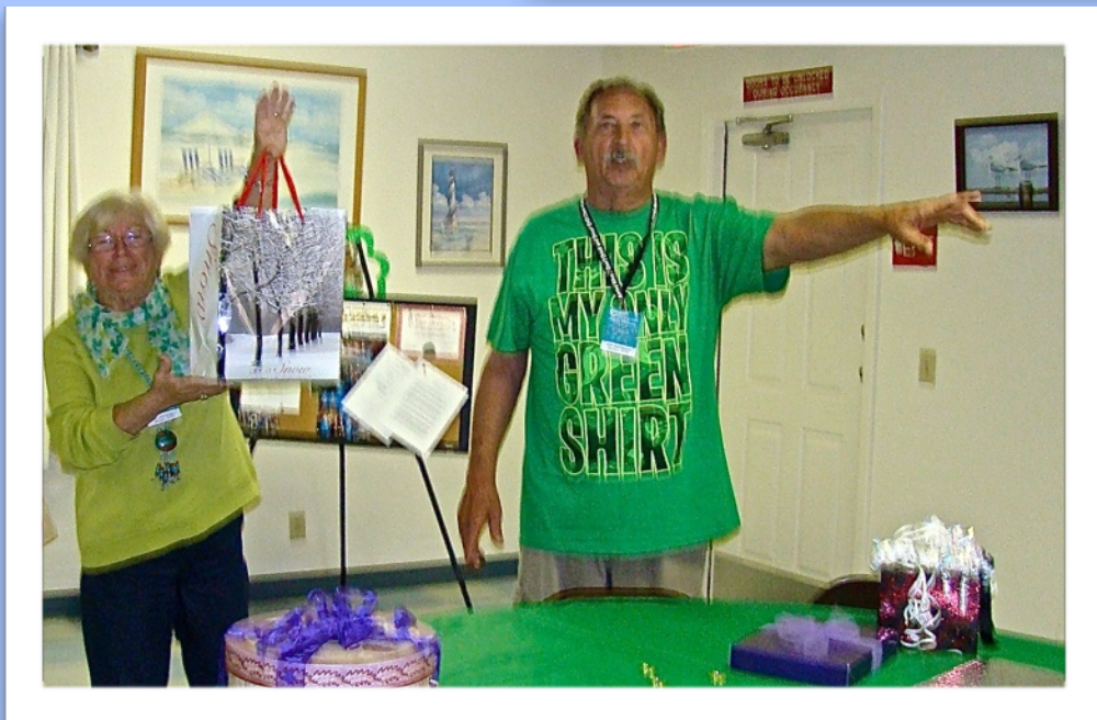
At the auction