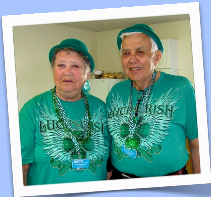
Our new leprechauns