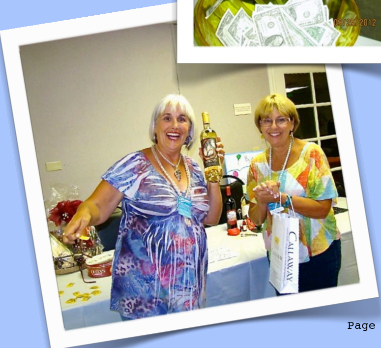
Playing Games Car Races and LRC And Winning