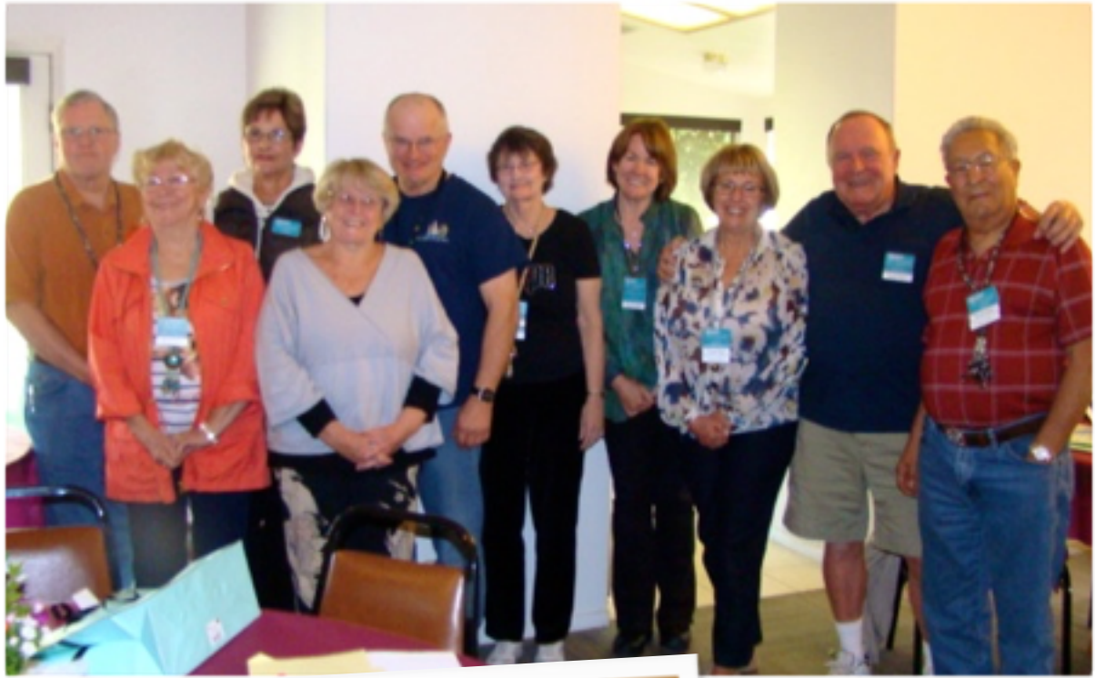
New officers.. Officially installed