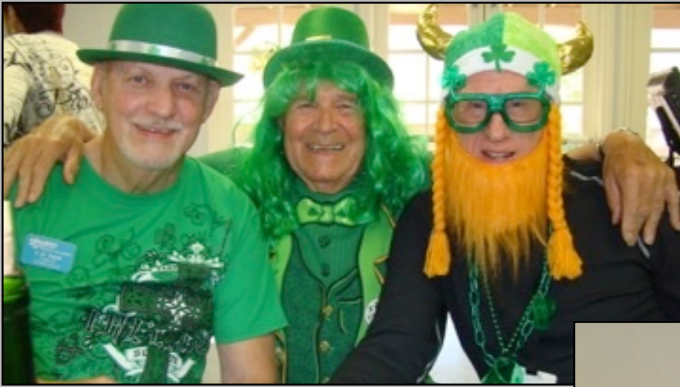
Lots of green goin' on.