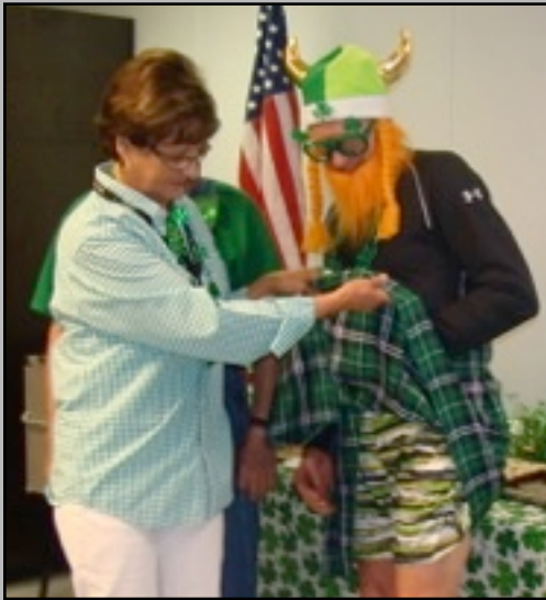
Move along. Nothing to see here, folks.