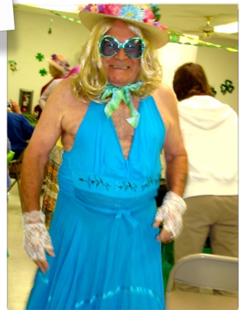
The second most beautiful It must be the glasses.