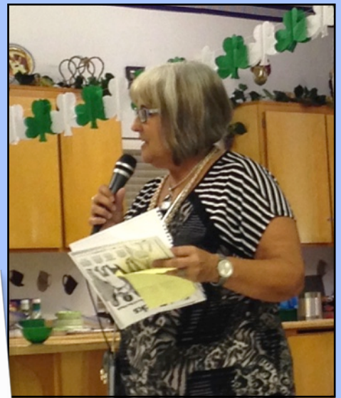
The most beautiful It must be the hair.