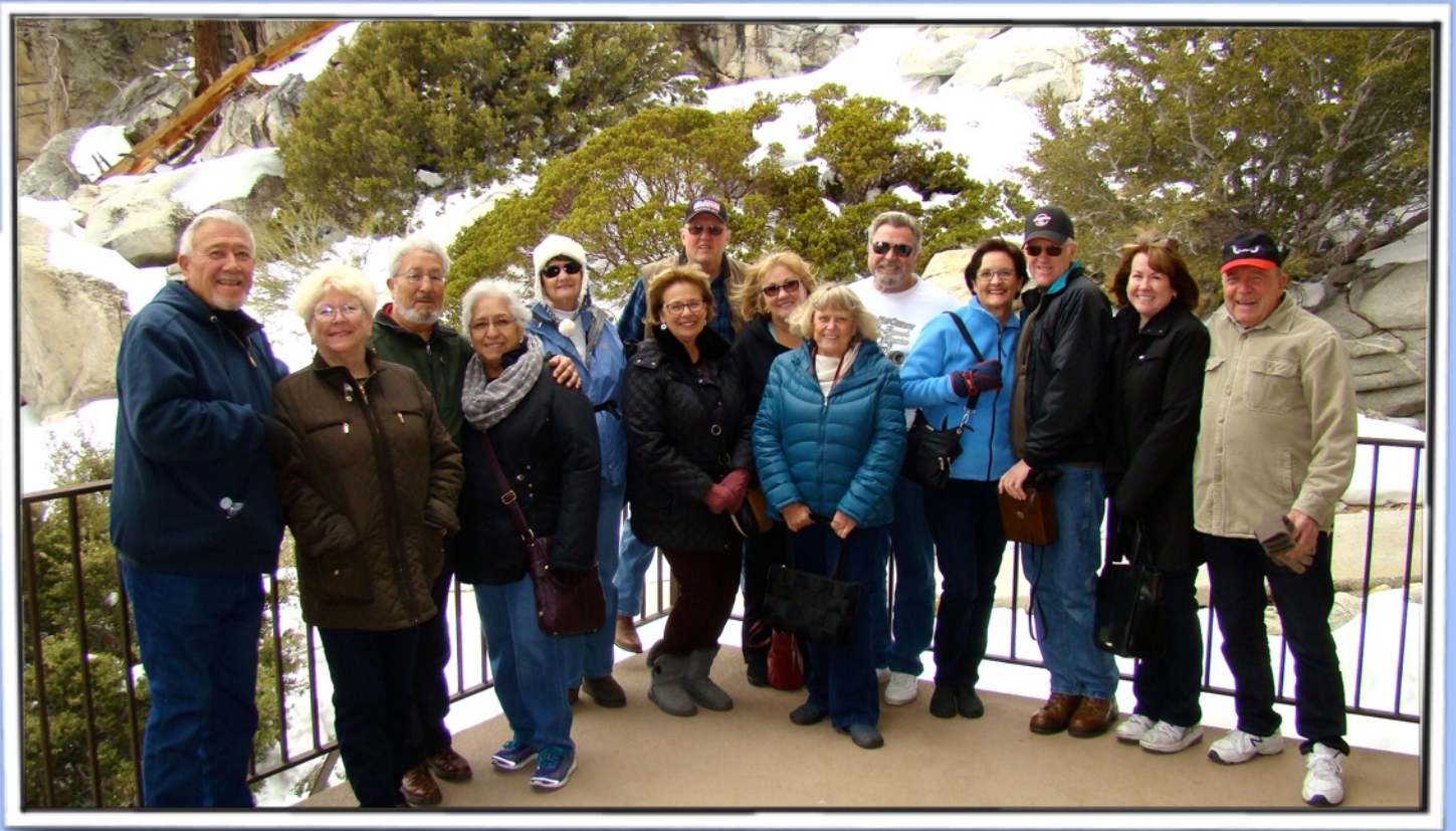
Chillin' on top. Brrr!