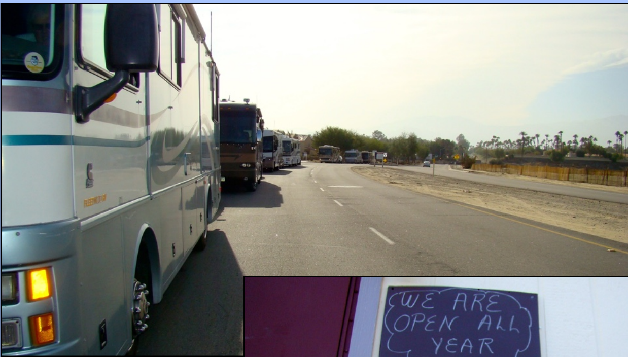
Caravanning and camping at Quartzsite.