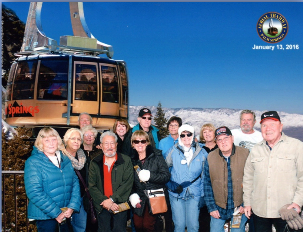
After breakfast we took a trip up Mt. San Jacinto. What a view.