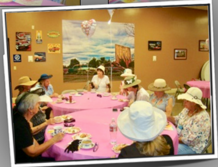
Pinkies up! It's time for tea